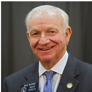
Max Burns Georgia Senator