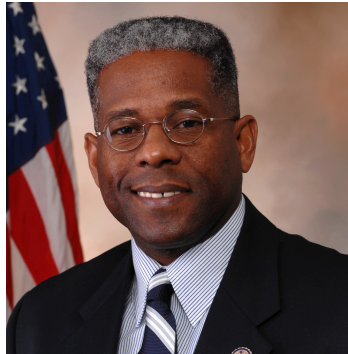
LTC Allen West Executive Director of the American Constitutional Rights Union