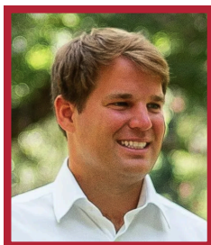
US House of Representatives Jim Kingston